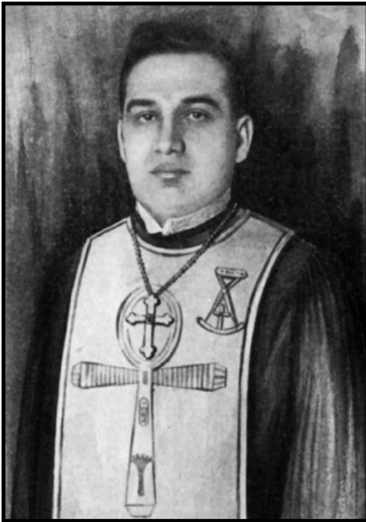
H. Spencer Lewis, 1915.

a particular time. He was to speak of this to no one.