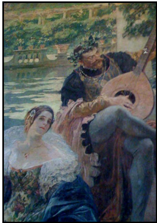
The Troubadour Singing to His Love ( detail ). The Hall of the Illustrious in Toulouse's Capitole displays a series of three murals depicting a troubadour singing to his Love—as a young man, as a middle-aged man (as illustrated here), and as an elderly man. The woman, representing the eternal tradition, remains forever young in the series.

The troubadours, who sang in the language of Oc, found a veiled way to perpetuate the Occitan traditions and their source, the ancient mysteries, through poetic symbolism. While the troubadours appeared to be singing about the love of a man for a woman, they were really referring to the laws of spiritual love. They were expressing the bliss of union with the Divine and the peace that results from this communion. One of the symbols the troubadours used to represent the inner desire of the soul for this mystical union was the rose.