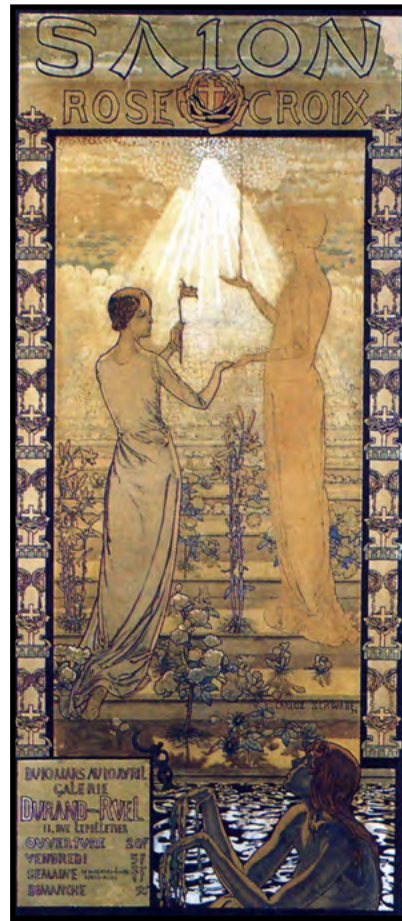
Poster for the Rosicrucian Salons, 1892.

One of these paintings is The Appearance of Clemence Isaure to the Troubadours . In it, Clemence Isaure shows the seven troubadours the charter of the Jeux Floraux, which includes the rose and the cross. She is accompanied by three Muses and by the goddess Minerva, the Egyptian Isis.