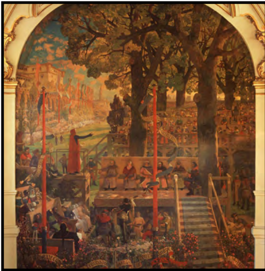
The First Meeting of the Jeux Floraux, the Very Joyful Company of the Seven Troubadours, May 3, 1324, by Jean-Paul Laurens, 1912. Exhibited on the Grand Staircase leading up to the Hall of the Illustrious in the Capitole, Toulouse, France.